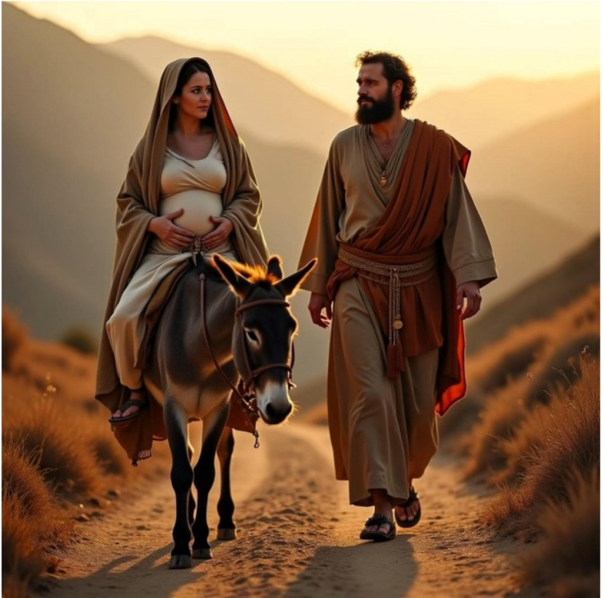
Joseph, Mary, & Donkey, on their way to Bethlehem