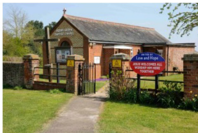
Perry Green Chapel Peters Green