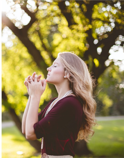
Hot & Cold Drinks and Snacks will be served from 5.15 pm.